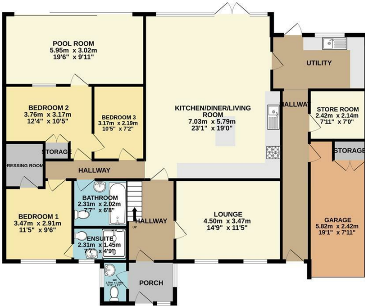
GROUND FLOOR 164.6 sq.m. (1772 sq.ft.) approx.